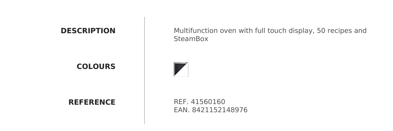
The SteamBox Included