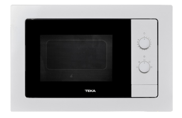
Defrost By Time